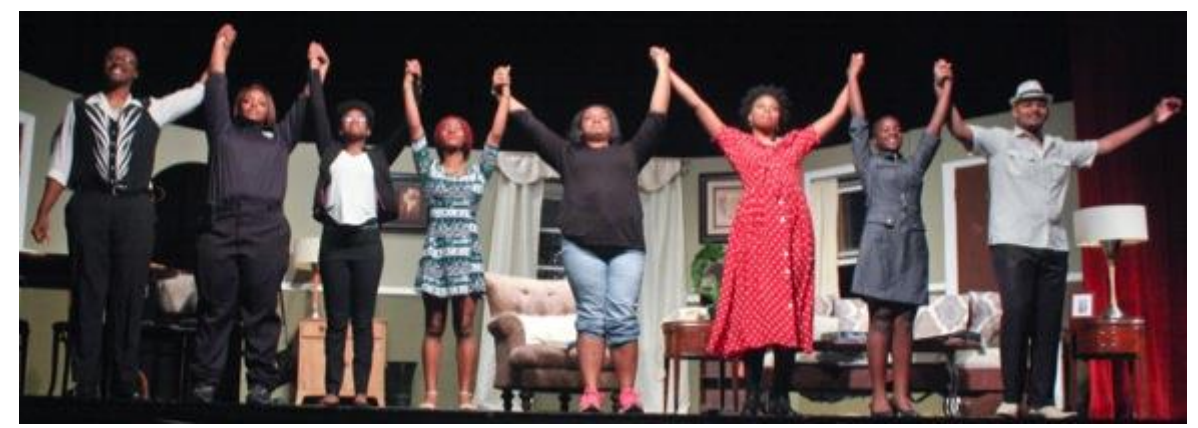
Pictured (above): Cast from the opening night performance of The Odd Couple (Female Edition).