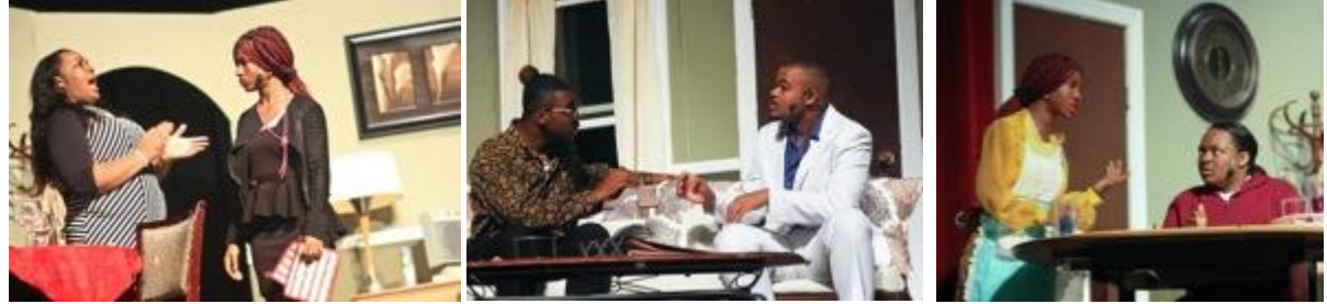
Pictured (left to right): Cast from the opening night performance of The Odd Couple (Female Edition), including Olive and Florence; Manolo and Jesus; Olive and Florence.