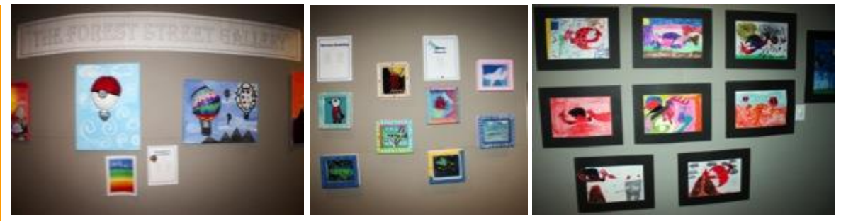
Pictured: Artwork displayed by Forest Street students.