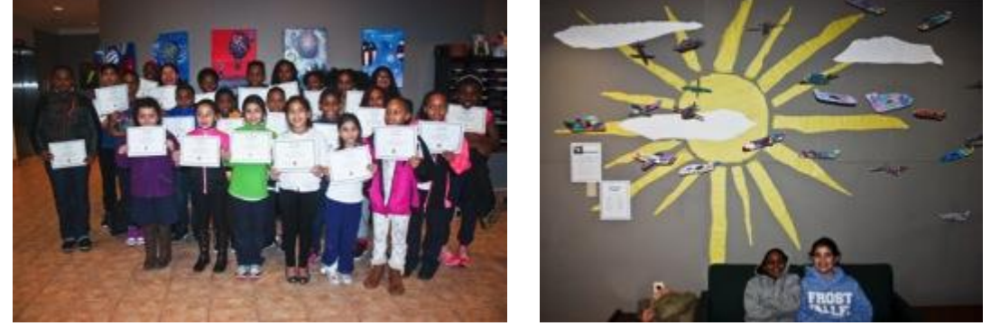
Pictured: Group photo and artwork displayed by Forest Street students.