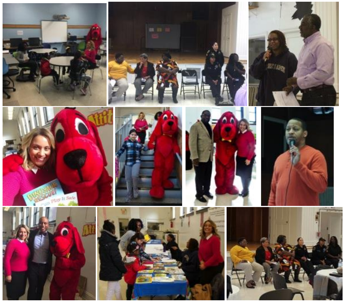
Pictured: Scenes from the Parent Academy Town Hall Meeting on Safety.