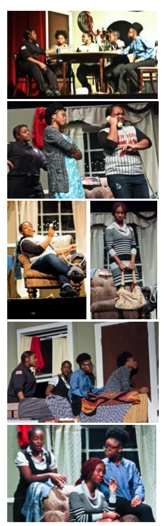
Pictured: Scenes from opening night for the Odd Couple (Female Edition).