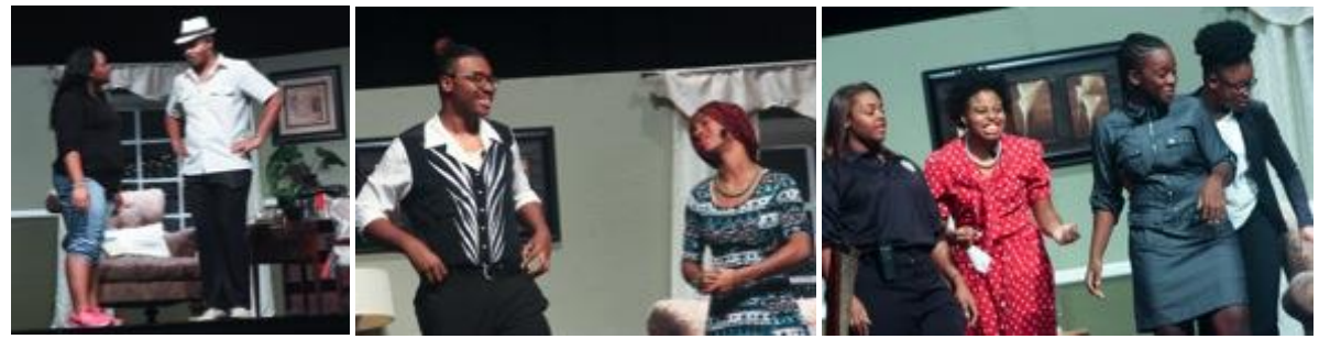
Pictured (left to right): Cast from the opening night performance of The Odd Couple (Female Edition), including Olive and Manolo; Jesus and Florence; Mickey, Vera, Renee and Sylvie.